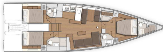
Lower deck - 3 cabins / 3 heads