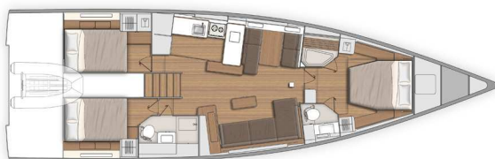
Lower deck - 3 cabins / 2 heads